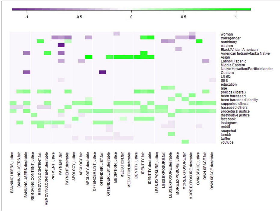
Figure 2. Heat map showing correlation coefficients of preferences for actions by independent variable (race, age, social media use, etc.).

SD=1.50 ), payment (justice: M=4.15 , SD=1.89 ; fair: M=4.58 , SD=1.72 ), own space (justice: M=4.05 , SD=1.79 ; fair: M=4.37 , SD=1.68 ), and more exposure (justice: M=3.34 , SD=1.69 ; fair: M=3.75 , SD=1.56 ). Other actions revealed differences, for example, the payment action was significantly more desirable ( M=4.72 ; SD=1.90 ) than just ( M=4.15 ; SD=1.89 ), whereas the mediation action was significantly more fair ( M=3.78 ; SD=1.77 ) than desirable ( M=3.52 ; SD=1.92 ).