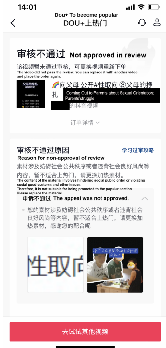
Figure 3: Dou+ informs a user that the purchase failed because the content review is not approved, signaling potential shadowbanning. (English translation provided in the image by the first author)

on their experiences and folk theories to increase their content's visibility and popularity, even though doing so primarily involved avoiding posting explicitly queer content.